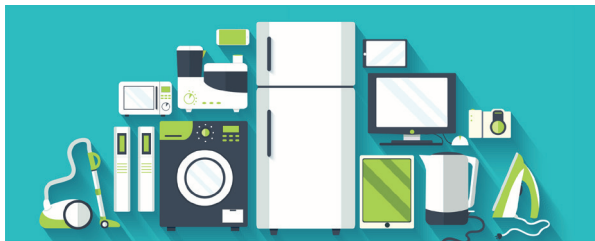
Electricity → EMI